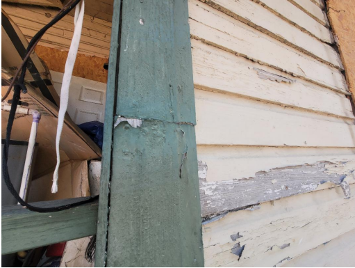
Exterior(001) B-Wall, Left Wood Corner Lead-Positive, Deteriorated