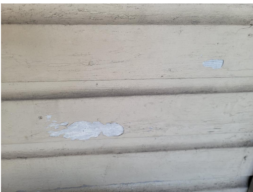
Exterior(001) A-Wall, Center Wood Siding Lead-Positive, Deteriorated