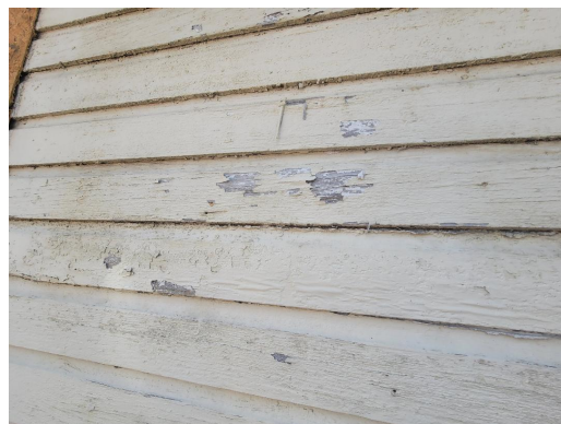
Exterior(001) B-Wall, Center Wood Siding Lead-Positive, Deteriorated